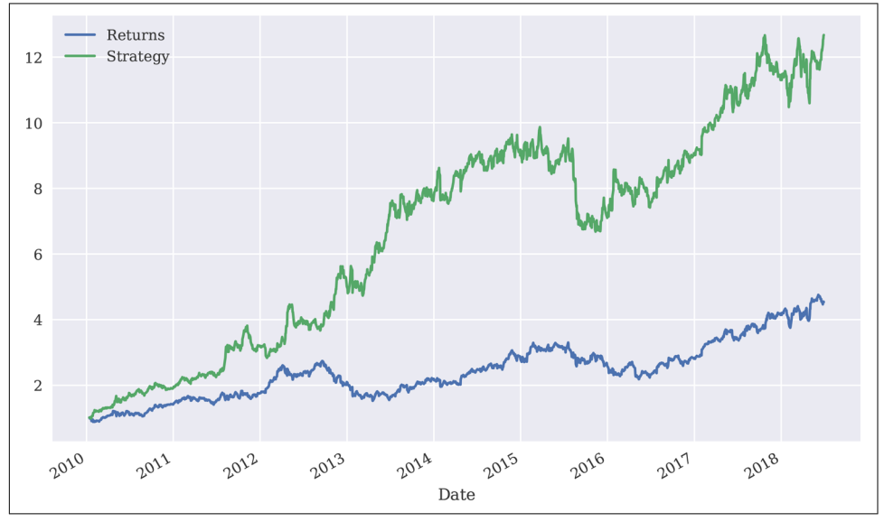
Figure 1-2. ML-based algorithmic trading strategy vs. passive benchmark investment in Apple Inc. stock

• Plots the performance of the ML-based trading strategy compared to the performance of the passive benchmark investment.